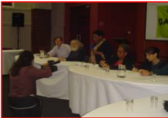
Press briefing in Durban in support of Biowatch April 2007

There has been overwhelming support for Biowatch from civil society. The issues raised are clearly wider than Biowatch's particular case, and include the constitutional right to a healthy and safe environment and the potentially chilling effect that the judgment could have on public interest litigation in South Africa. Access to information, the right to know, the right to choose, public vs. corporate interest and the closing down of democratic spaces are all areas that can be affected.