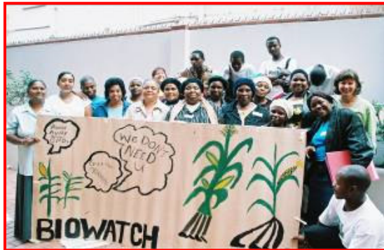
Participants at the Diakonia Council of Churches Environmental Justice Course 2007, showing support for Biowatch

The judgment can be viewed in its entirety at www.biowatch.org.za under DOCUMENTS, ACCESS TO INFORMATION CASE.